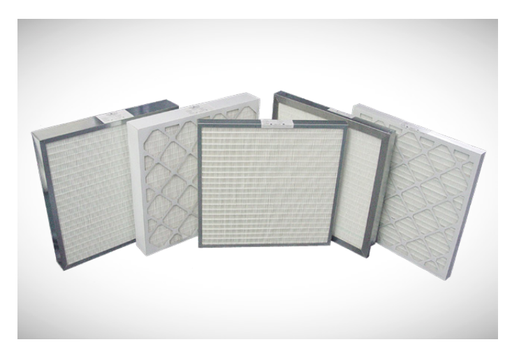
The Tri-Cell Thin Line series.