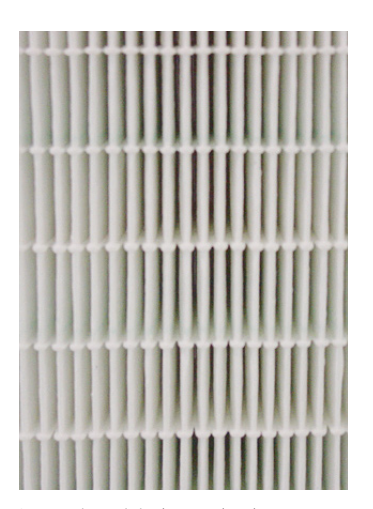
Innovative mini-pleat technology