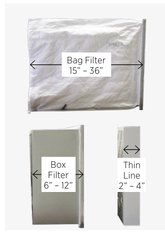
Thin Line compared with traditional bag and box filters.