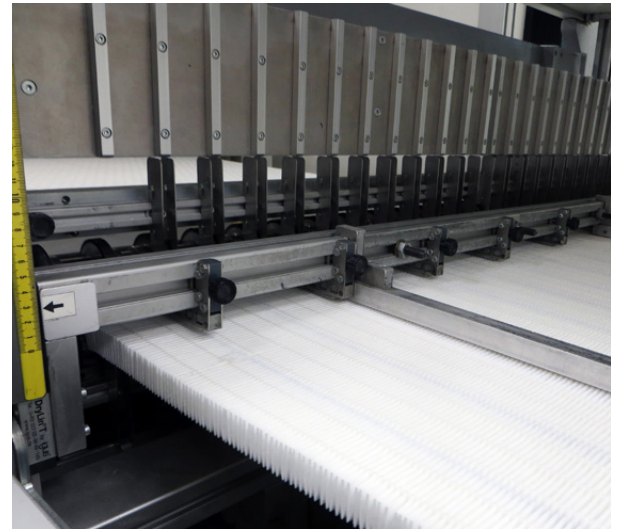
Tri-Dim's cleanroom production area