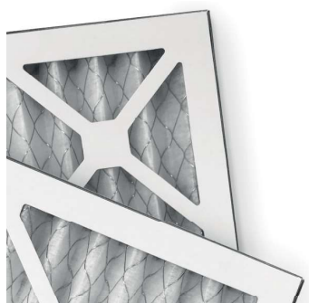
Close-up of Prime8 frame, media & wire